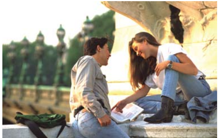
Fixed using our method