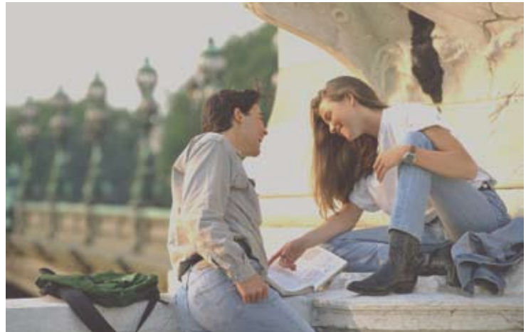
Auto Levels applied